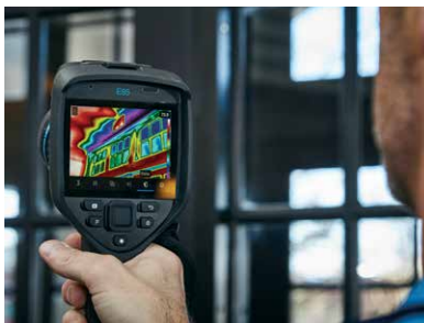
One-handed operation with convenient buttons for safe, streamlined use