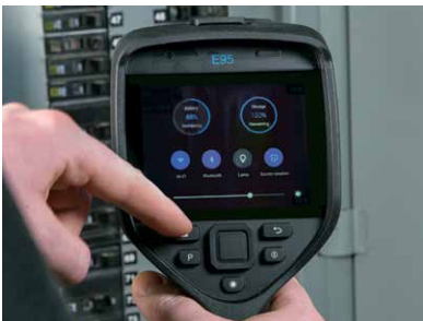
Streamlined data collection and sharing speeds analysis and repairs