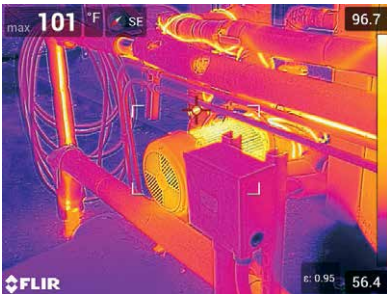
Find problems quickly and eliminate costly plant shutdowns