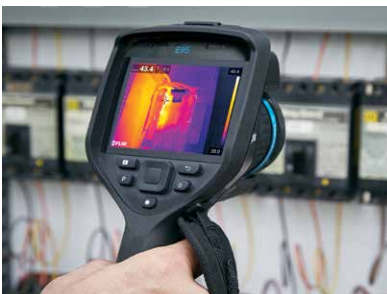
One-handed operation with convenient buttons helps maintain workplace safety