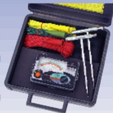
MODEL 4102A-H ( Hard Case Model)