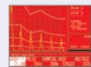
DAC (Distance Amplitude Correction)