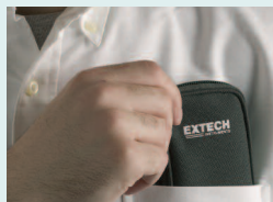
Includes holster and pouch carrying case for added protection