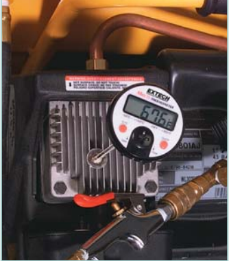
measuring high temperature on motors and other flat surface areas including grills.