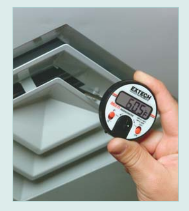
Stem thermometer ideal for measuring temperature in HVAC applications such as air ducts, vents, and heaters.