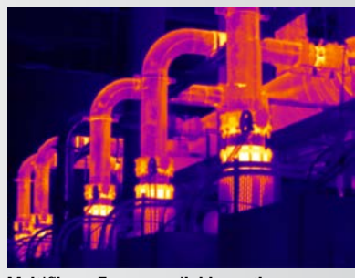
MultiSharp Focus, available on the Ti450 PRO and Ti480 PRO