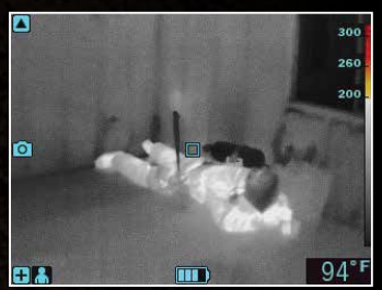
For use with lower temperature situations, such as initial rescue efforts after traffic accidents, searches in wooded landscapes, etc.