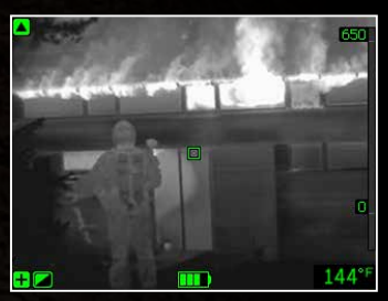
Same as the TI Basic mode but a grey scale image.