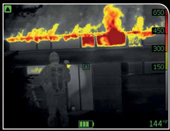
For initial fire attack and life rescuing