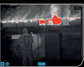
Used for finding hotspots. The hottest 20% of the scene is colored in red.