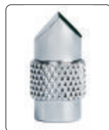
knife-edge push tip