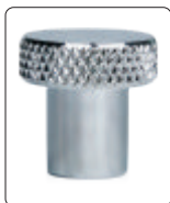
flat push tip