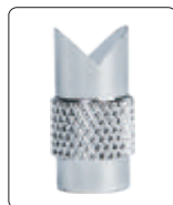
V type push tip