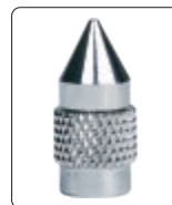
point push tip