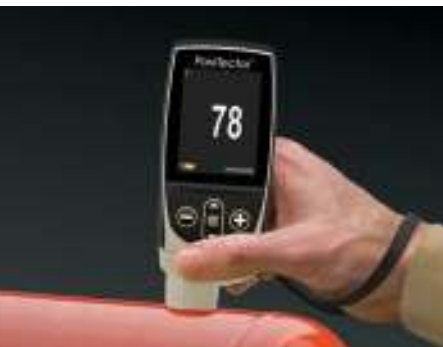
For measuring paint, powder, etc. on all metals...