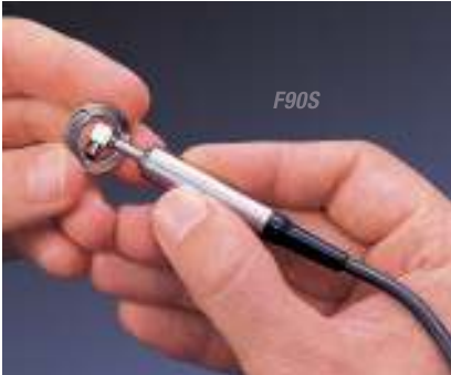
Microprobe series for small parts and hard-to-reach areas