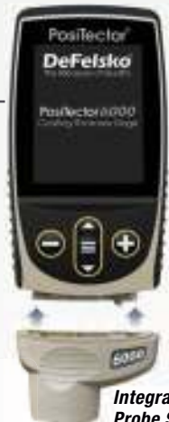
Integral Probe Style