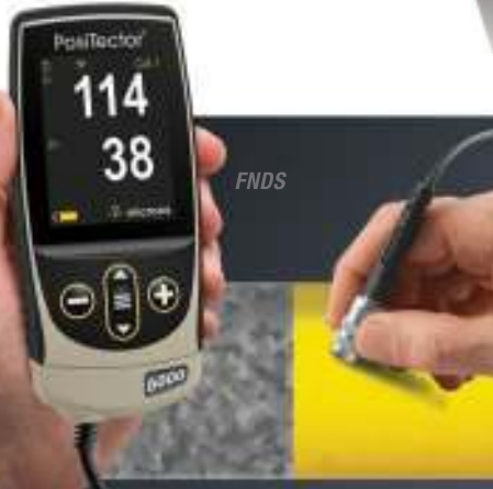
Duplex Probe measures individual layer thicknesses of zinc and paint in a duplex coating system