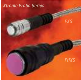
Xtreme Probes with Alumina wear faces and braided cables for hot/rough surfaces