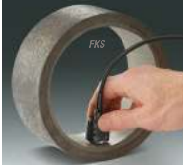
Thick Probe series for thick protective coatings: epoxy, rubber, fireproofing, and more