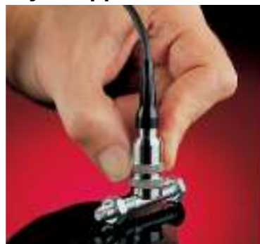
...and for measuring galvanizing, plating, anodizing, and more.