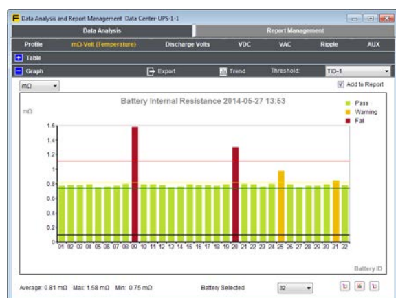
Histogram of a battery string with user defined threshold.