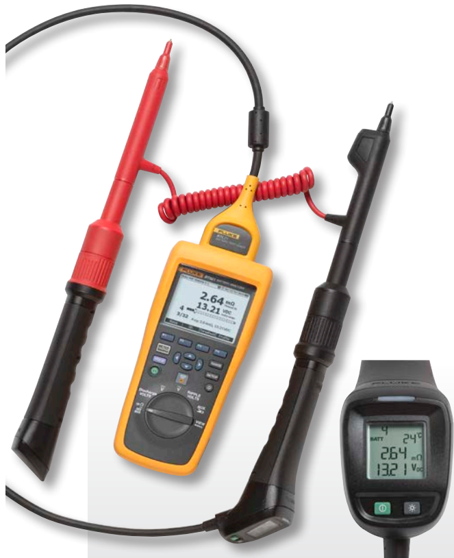
Intelligent test probe with integrated LCD display