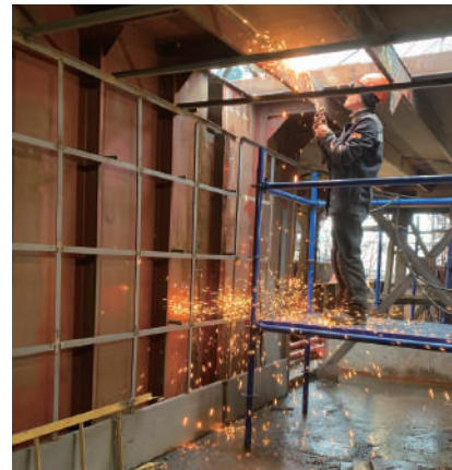
Factory supervision, engineering inspection