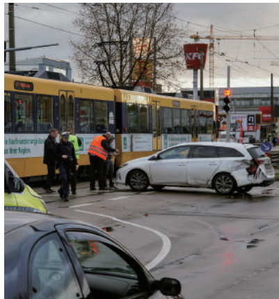
Traffic accident evidence gathering