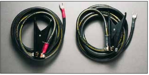
Cable set GA-05052