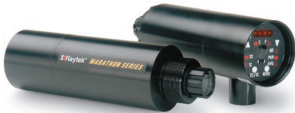
Marathon MR Ratio Thermometers

FA/FR Marathon fiber-optic thermometers allow measurement of targets that would be otherwise inaccessible because of space constraints or harsh environments. Separated by a flexible fiber-optic cable, the optical head may be positioned near the target with the rugged electronics housing installed remotely in a convenient location.