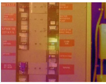
50 % blending