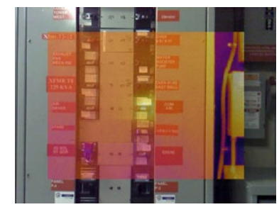
50 % blending, picture-in-picture mode